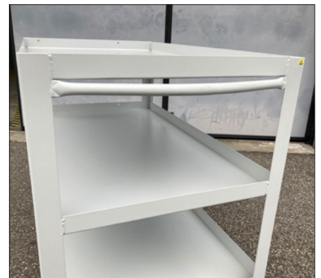
Reinforced metallic integrated handle