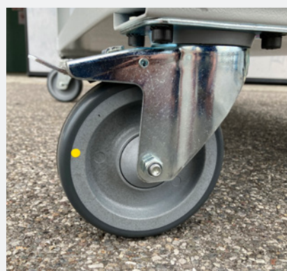
conductive ø125 mm rubber wheel