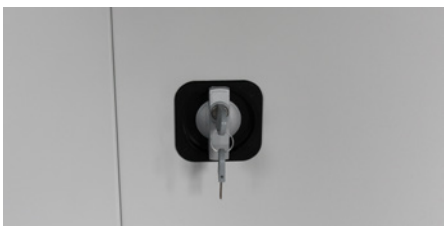
Lock-handle with 2 identical keys