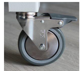
Rubber wheel with a brake