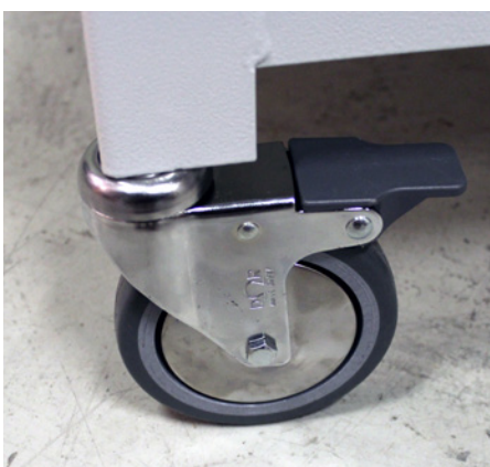
Conductive ø100mm rubber wheel with a brake