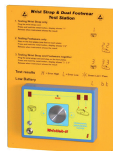
Wristlab-II measuring station