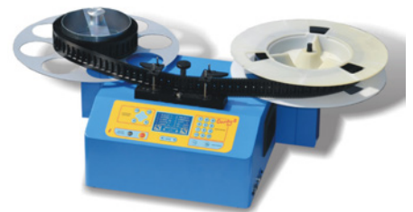
Piece counter with empty 360mm aluminium reel code 4912

EMPTY POCKET CHECK Verifies the component is present (OPTIONAL ADD-ON)