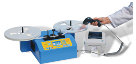
It's possible to connect the piececounter to a printer and a barcode pistol. code 16362 and 16359