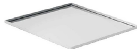
Single tray (cod.20949)