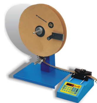
reel holder cod. 834